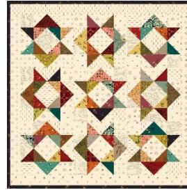
In and Out