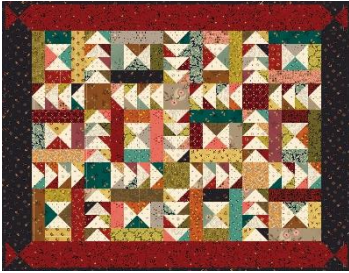
Birds of a Feather

Fat Quarters – 18" x 21" ♦ Fat Eighths – 9" x 21" ♦ Skinny Eighths – 4 1/2" x 21" Chubby Sixteenths – 9" x 10 1/2" ♦ Bitty Bricks – 4 1/2" x 10 1/2" ♦ Squares – 6" x 6"