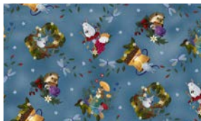
2149-17 Tossed Characters Mist Blue