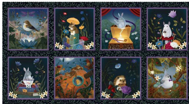
2153B-78 Continuous Blocks Navy