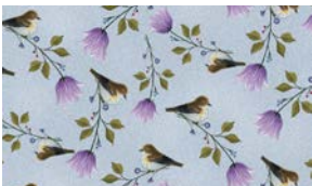
2146-11 Tossed Birds Blue Bell

All fabric quantities are based on 15yd bolts unless otherwise indicated.