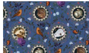
2152-75 Animal Portraits Sapphire Blue