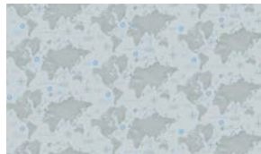
2194-90 Map Grey