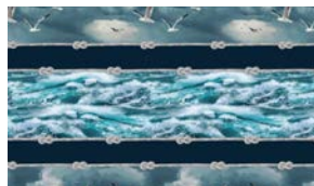
2198-70 Border Stripe Blue/Multi