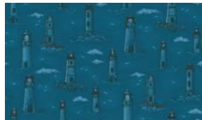
2195-77 Monochromatic Lighthouses Blue