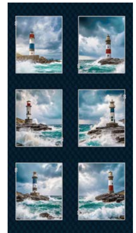
2197B-70 Lighthouse Blocks Blue/ Multi