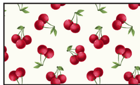
2218-08 Tossed Cherries White/Red