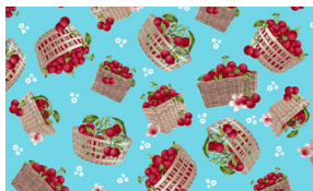
2217-18 Tossed Baskets Turquoise/ Multi

All fabric quantities are based on 15yd bolts unless otherwise indicated.