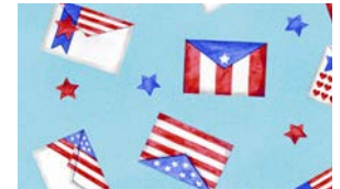
2163-17 Tossed Letters Light Blue/ Multi