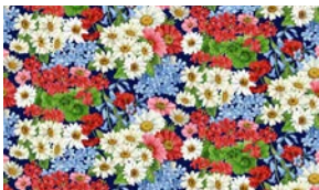
2157-78 Packed Floral Navy/Red

All fabric quantities are based on 15yd bolts unless otherwise indicated.