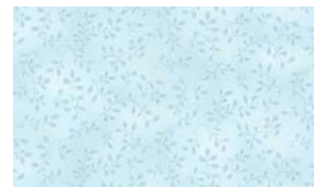
7755-07 Folio Basics Powder Blue