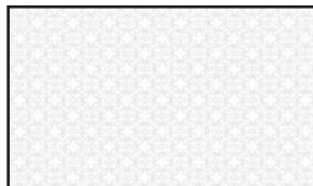
1063-01W Modern Melody White