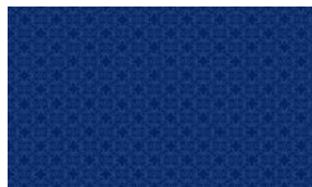
1063-77* Modern Melody Navy