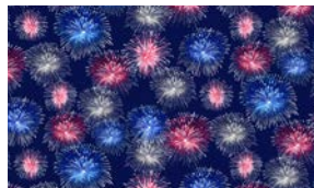
2159-78 Fireworks Navy/Multi