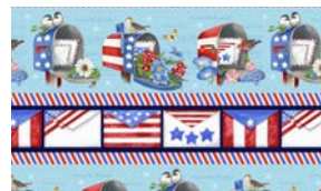
2164-18 Border Stripe Light Blue/ Multi