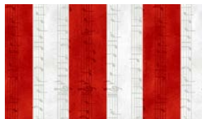
2162-80 Stripe Red/ White