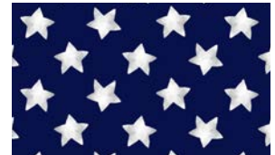
2161-70 Set Stars Navy/White