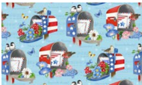
2156-18 Mail Boxes Light Blue/ Multi

All fabric quantities are based on 15yd bolts unless otherwise indicated.