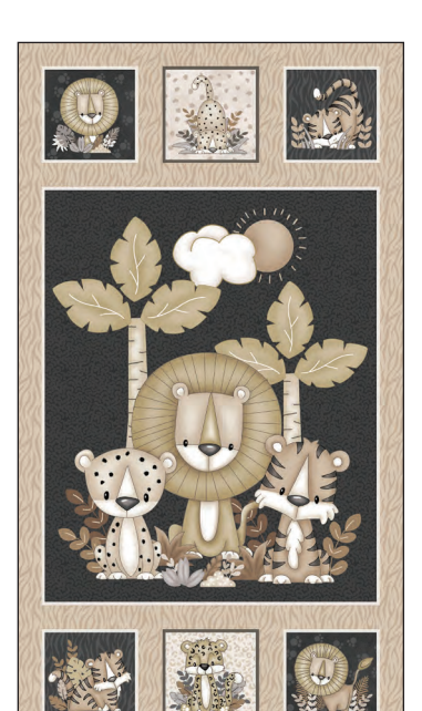
1641P-49 Big Kitty Panel - 24" Multi