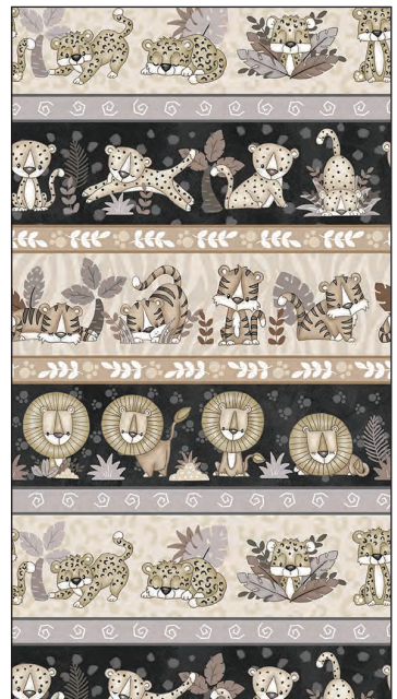
1639-49 Big Kitties Novelty Stripe - Multi