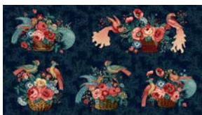
3484-77 Baskets and Birds Prussian Blue