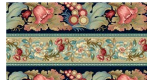
3483-74 Large Border Stripe Blue Multi