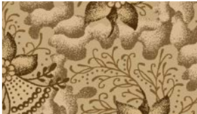
3476-44 Coral Fan Cream