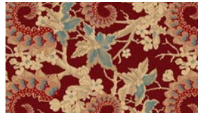
3480-87 Quirky Swirls Red/Teal