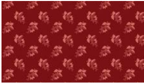
3475-88 Tossed Calico Red