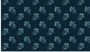
3475-77 Tossed Calico Prussian Blue