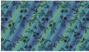
3474-17* Ombre Diagonal Teal/Blue