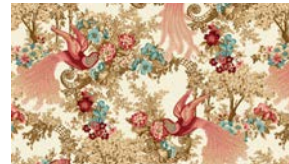
3482-43 Toile Cream/Caramel Multi