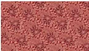
3476-80 Coral Fan Light Red

* Indicates binding fabric. FO = 18" x 22" (0.45m x 0.55m) All fabric quantities are based on 15yd bolts unless otherwise indicated.