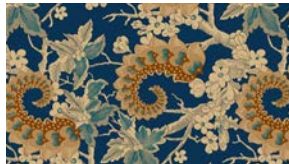
3480-73 Quirky Swirls Prussian Blue/Sienna