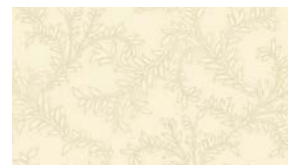
3485-44 Background Vines Cream