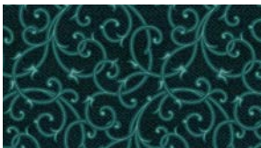
3479-76 Regal Swirls Dark Turquoise