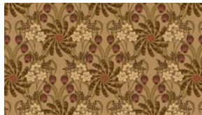
3477-33 Medallion and Lilies Caramel