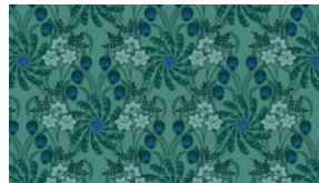
3477-76 Medallion and Lilies Light Turquoise