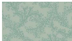
3485-17 Background Vines Light Teal