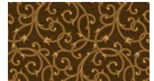
3479-38 Regal Swirls Brown