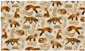
1885-33 Foxes Beige