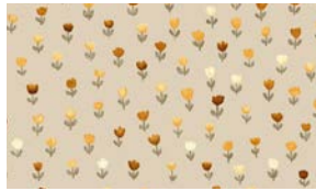
1886-33 Small Tulips Beige