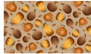
1892-33 Tossed Pumpkins Taupe