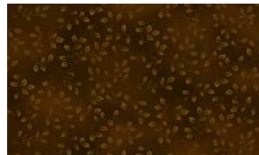
7755-39* Folio Basics Sepia Brown