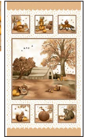
1894P-33 Fall Scene Panel Multi