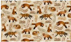
1885-33 Foxes Beige