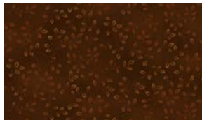
7755-38* Folio Basics Brown