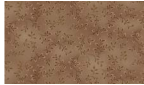
7755-30 Folio Basics Brown