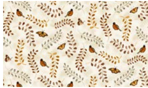
1887-40 Birds and Butterflies Cream