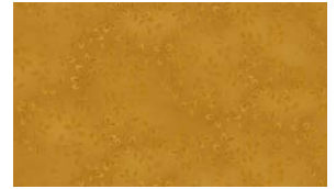
7755-33 Folio Basics Gold