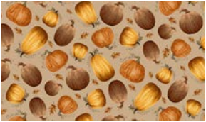
1892-33 Tossed Pumpkins Taupe