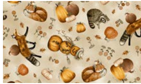
1888-33 Fall Motif Toss Beige