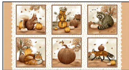
1884-33 Block Repeat Multi