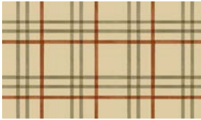
1893-43 Plaid Beige