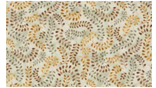
1890-66 Swirly Vines Sage