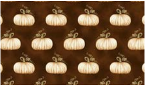
1891-33 Small Pumpkins Brown