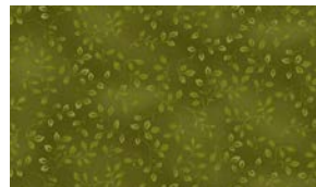
7755-65 Folio Basics Dk. Olive