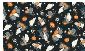
2026G-99 Tossed Ghosts Glow Black