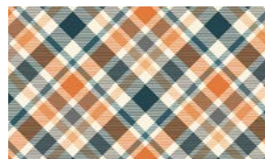
2025G-39* Bias Plaid Glow Multi