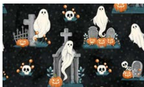
2024G-99 Allover Ghosts, Pumpkins and Skulls Glow Black

All fabric quantities are based on 15yd bolts unless otherwise indicated.