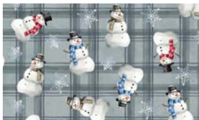
3513-11 Tossed Snowmen Slate Gray

* Indicates binding fabric. FO = 18" x 22" (0.45m x 0.55m) All fabric quantities are based on 15yd bolts unless otherwise indicated.