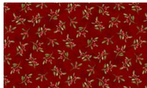
3515-88 Mistletoe Toss Red