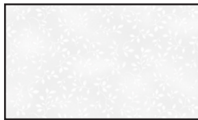
7755-09 Folio Basics Silver