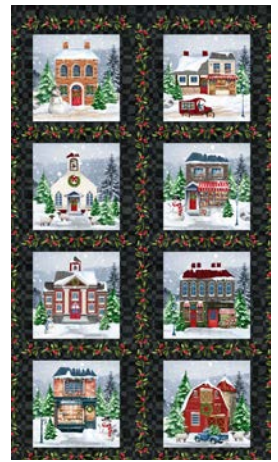
3522-99 Blocks Black