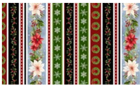
3516-89 Mini Garland Stripe Red Multi