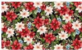
3517-99 Poinsettia Toss Black