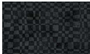
3514-99* Vintage Check Black